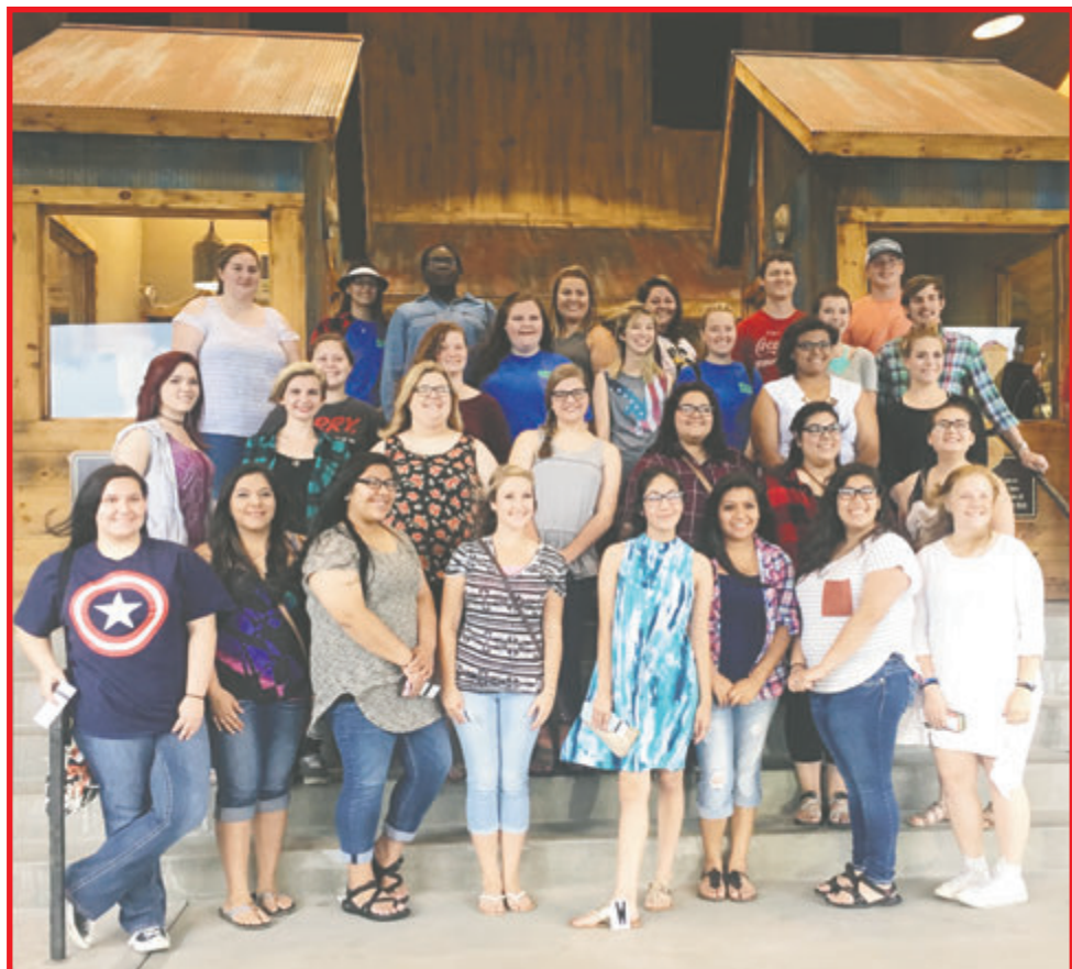
Upward Bound students pose for a photo before attending Dolly Parton's Lumberjack Adventure Dinner and Show in Pigeon Forge.