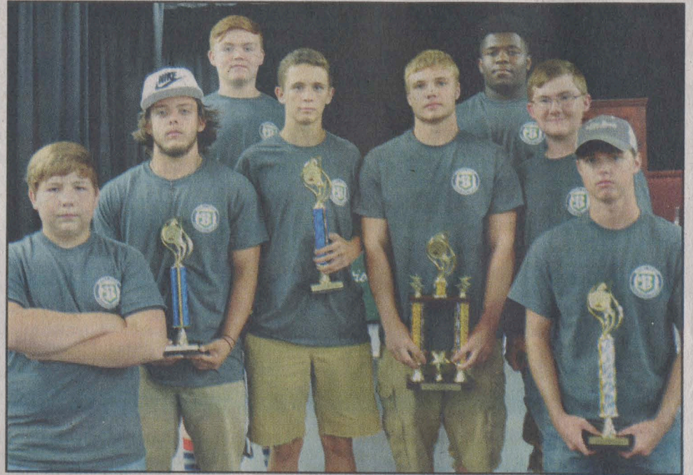
Students from high schools in Fayette County were among those participating in the recent Career Pathways Academy Robotics Camp