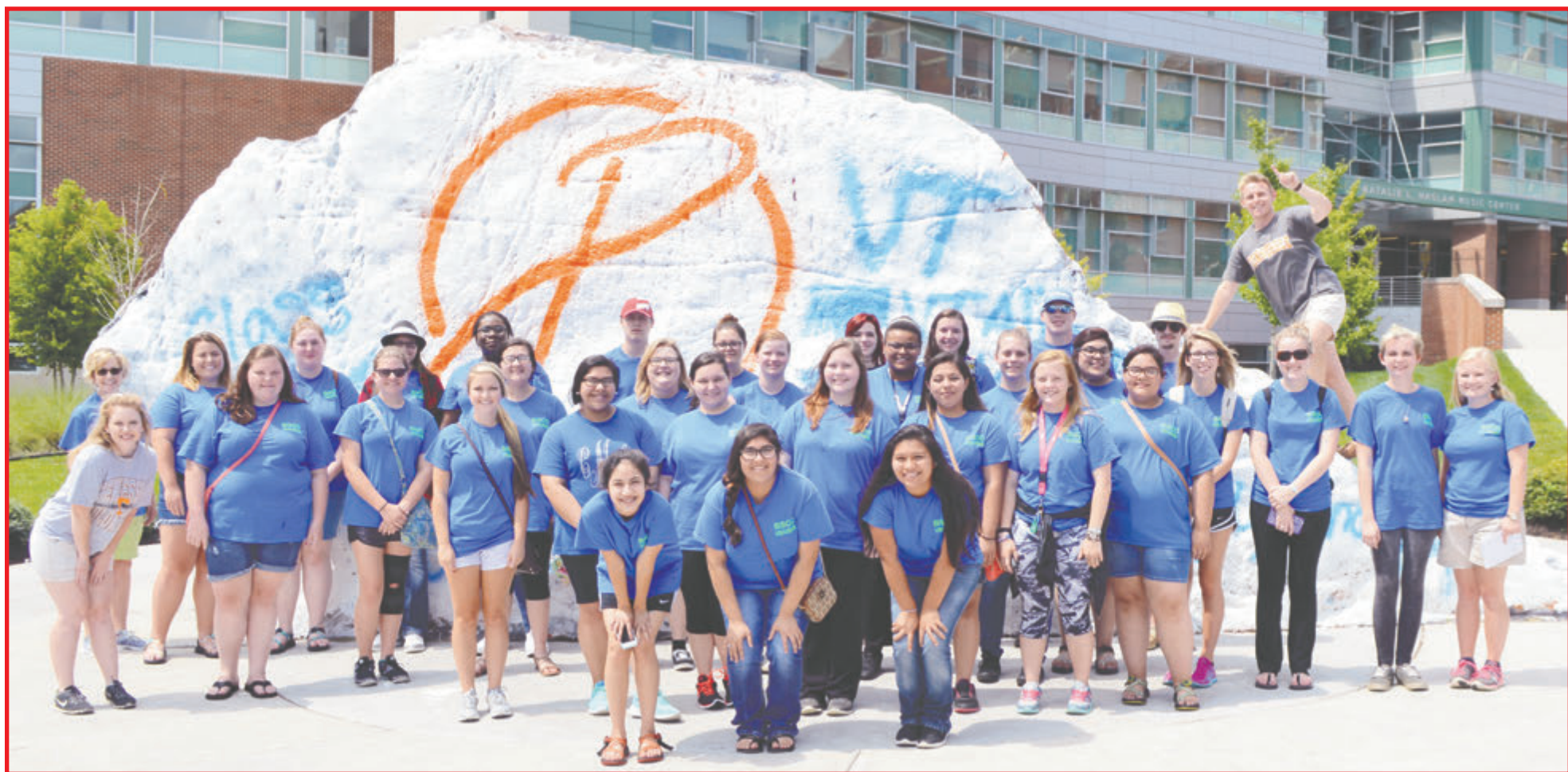
Upward Bound students pose in front of "The Rock" at the University of Tennessee in Knoxville.